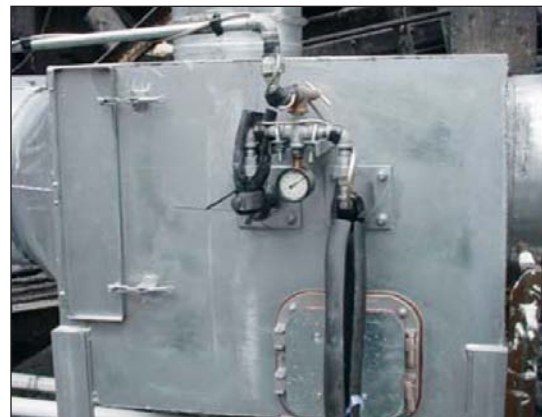
Easy Access Service Panels

The Englo system was installed to eliminate the fugitive dust escaping from the lime silo discharge and on the conveyor and silo during filling operations at this facility in West Virginia. The installation uses an Englo Type 18 Dust Extractor and Pre-Filter Box . Two pickup points with oversized hoods were installed to collect dust at the silo discharge point on the conveyor and an upper point when the coal is fed onto the belt. A third suction line was connected to the Silo overflow tube to provide negative suction on the silo as it is being filled.