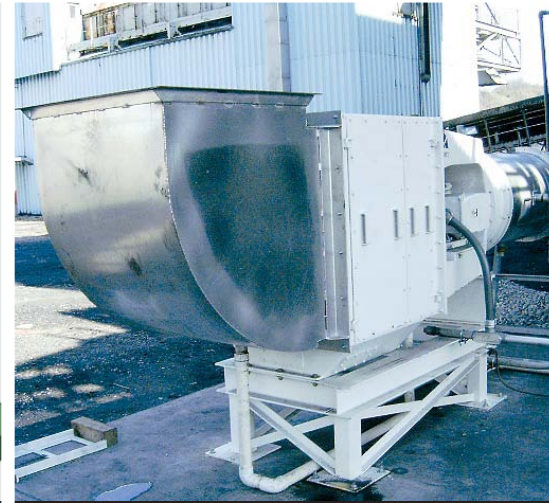
Englo Type 30 Extractor